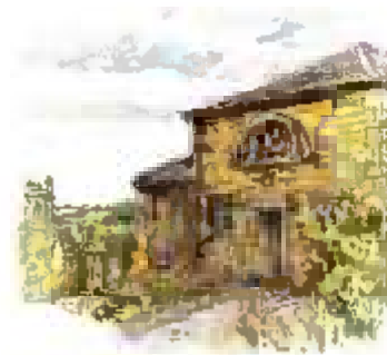
Illustration courtesy David Birch